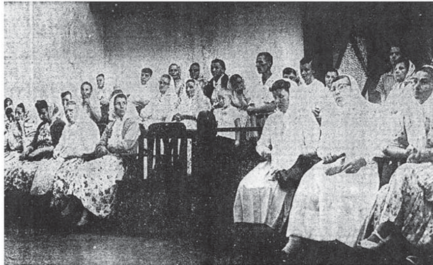
COURTROOM SCENE — These were some of the 60 spectators at the courtroom Friday when family court judge William Evans ordered release of 77 children from the New Denver school dormitory, ending the institu-

But in cartoons, their seriousness is lampooned as a lack of care about their appearance. Sons of Freedom women are presented as being outside cultural norms because they lack so-called feminine modesty. They are pictured as dirty women who are no better than farm