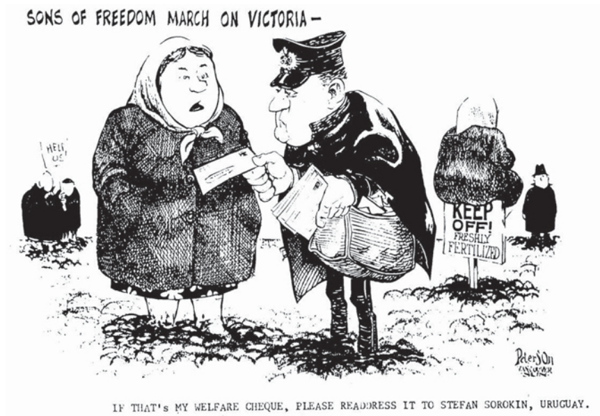
Figure 4 Cartoon by Peterson, Vancouver Sun . Date unknown.

animals (fig. 4) and whose desire to protest can only be understood as a desire not to be “housewifely”—which for one cartoonist is a joke in itself (fig. 5). In view of the turn to materialism, the values of the Sons of Freedom women in the media not only provide a contrast to what is happening in the rest of BC: these values are on a head-on collision course with that world. Although by 1955 the coverage in The Victoria Daily Times had softened to some extent, reporting on the tears of Sons of Freedom women who went to the capital to ask the Attorney General for their children back, supported by letters to the editor in sympathy with the women (Halsall 1955; “Douk mothers” 1955; “Why Make” 1955), other reporting continued to represent Sons of Freedom women as inhuman. This is why, for instance, Doukhobor mothers were often shown in the media as uncaring, as in the article in the Vancouver Sun of 1959 when women are finally reunited with their children from New Denver, “Doukhobor Mothers Happy But You’d Never Know It” (1959), or when an editorial from The Vancouver Province says that “kindness” does not work for Doukhobors and so they should all be exiled (1952). In The Nelson Daily News